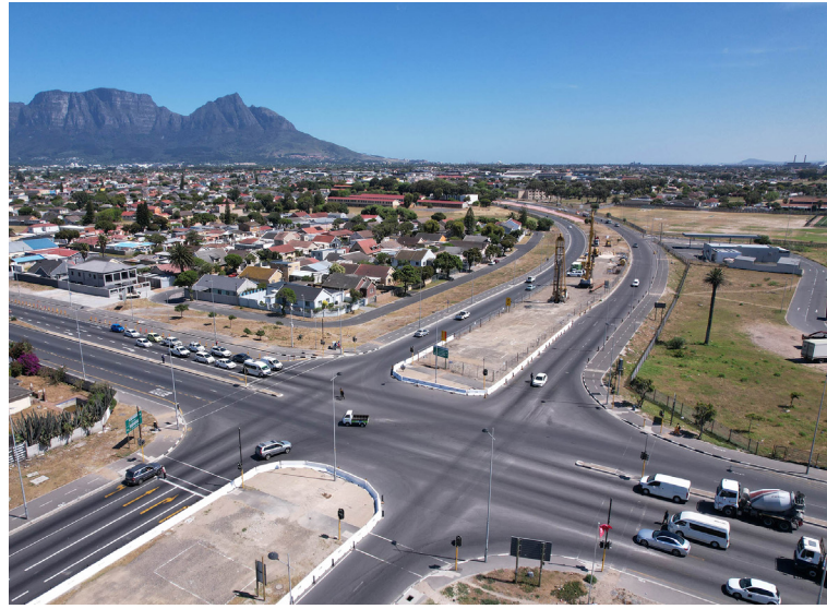
Construction is being undertaken in phases to limit the impact on traffic.