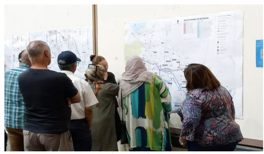
Residents in Wynberg helped identify locations for new bus stops in the area.

We would like to extend a special thank you to everyone who was able to join us at these events as well as to everyone who submitted comments. There is still an opportunity to comment on some of the proposals. Once the public comment period for each